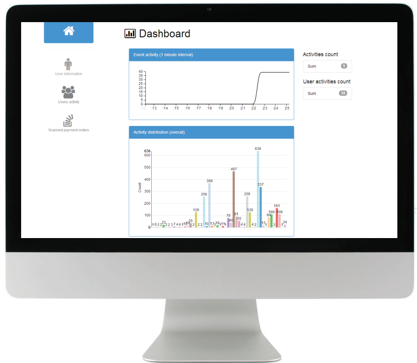
Real-time dashboard view, updates as events are being received

In order to improve operational efficiency, one has to start by measuring it. BALP is the perfect gauge.